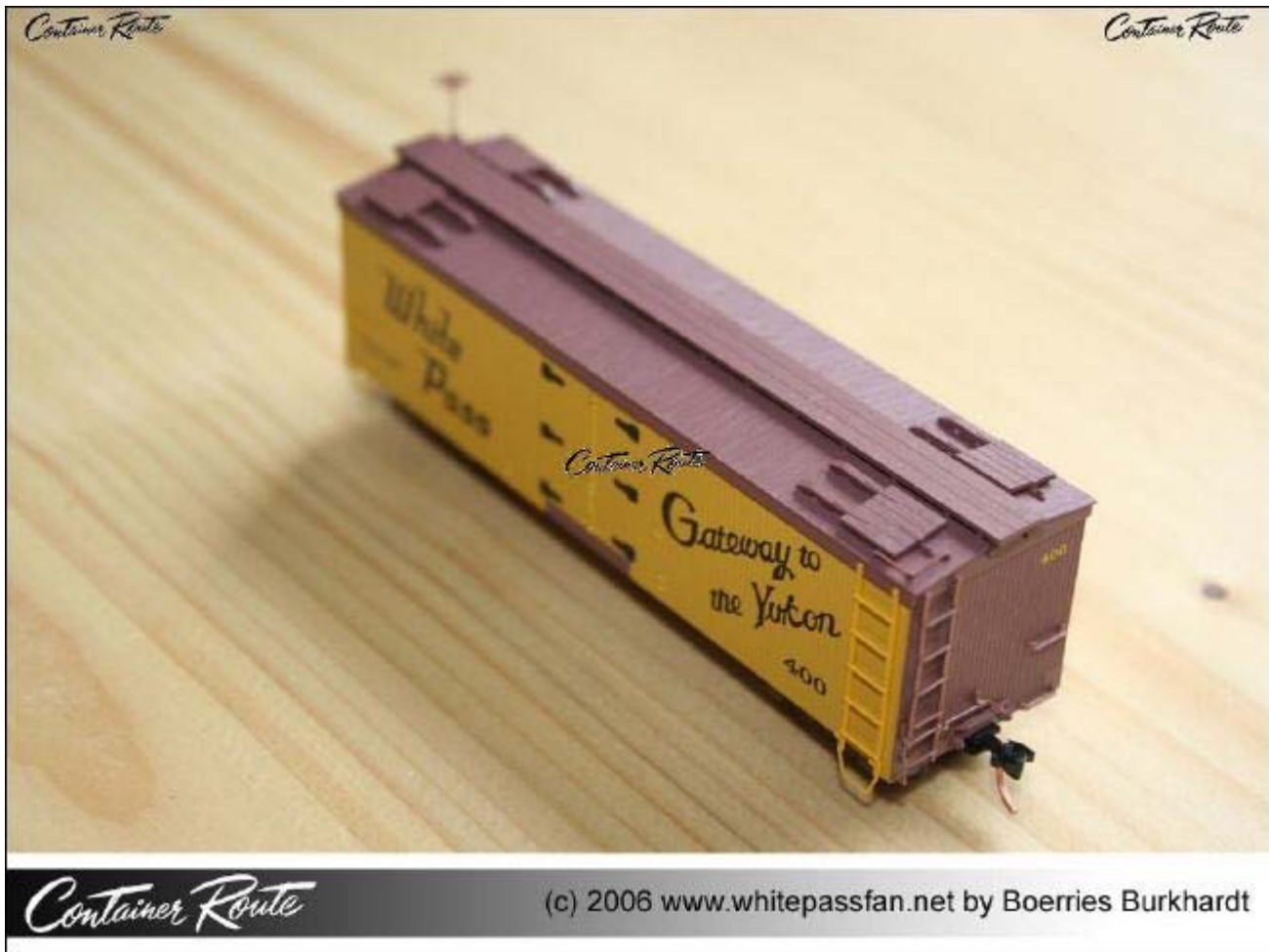
Micro-Trains WP&YR 400 Reefer Top View The side ladders as well as the grab irons are made of Delrin.

The underframe has full detail and the brake systems look like its ready to brake. This car has more underframe and front details than you normally see on HO gauge freight cars. Micro-Trains sets high level standards like dedicated model builders have. Roof and hand rail have the same great quality.