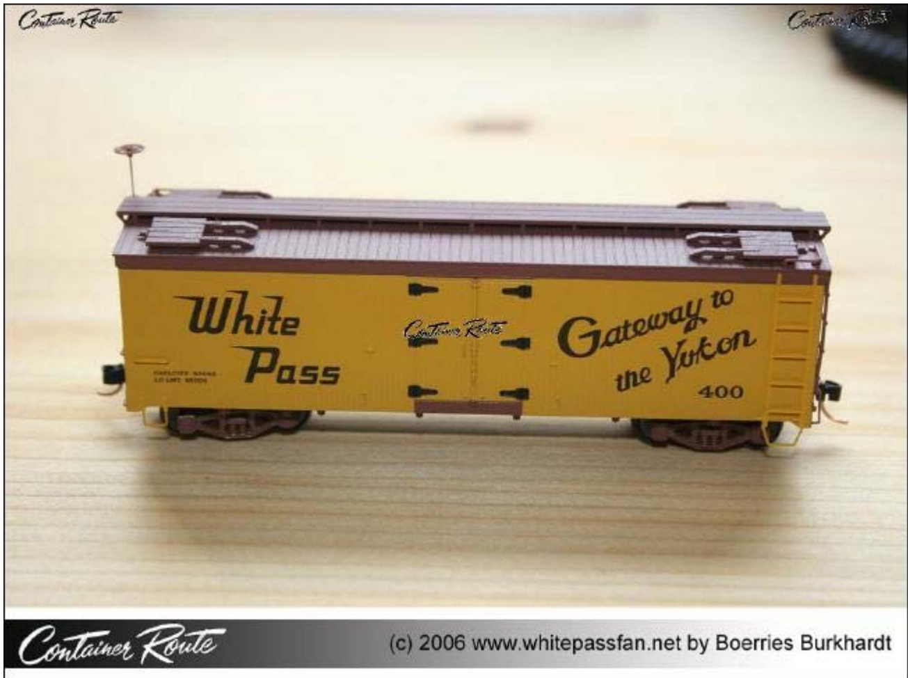
Micro-Trains WP&YR 400 Reefer Side View The paint is very sharp and perfectly applied.