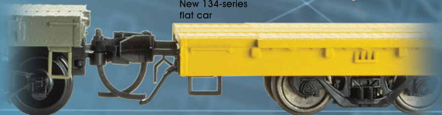
New 134-series flat car